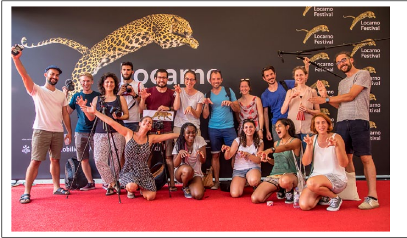
Figure 1. Photograph of the course Storytelling and Storyboarding Science held at the Locarno Film Festival in 2018.

Note. The course was organized by the Swiss Academy of Sciences and the Science Film Academy. Participants came from 12 Swiss universities and research institutes.